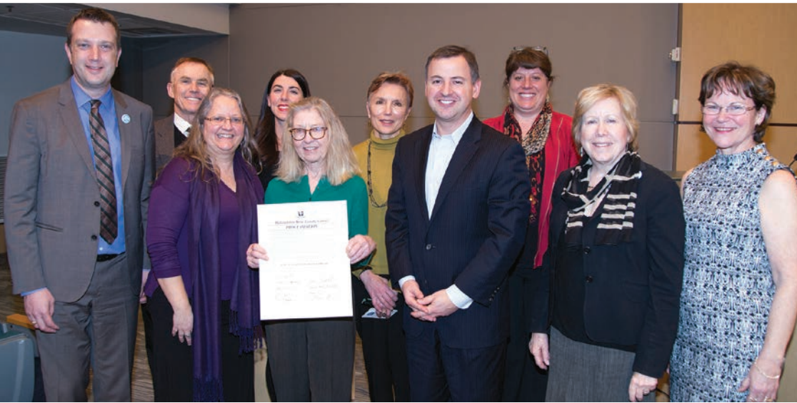
(Above Left): King County Councilmembers, sexual assault partner agencies, and KCSARC staff declare April 2017 as Sexual Assault Awareness Month across King County.