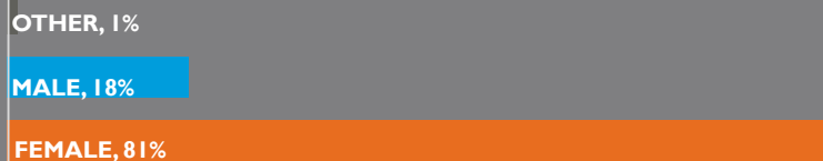
Gender of clients served in 2017 KCSARC cases

● FACT: KCSARC is leading changing the conversation about sexual assault. In 2017, KCSARC was referenced as an expert in 57 news articles, online and in print.