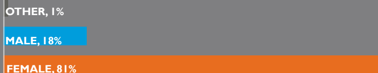
Gender of clients served in 2017 KCSARC cases

● FACT: KCSARC is leading changing the conversation about sexual assault. In 2017, KCSARC was referenced as an expert in 57 news articles, online and in print.